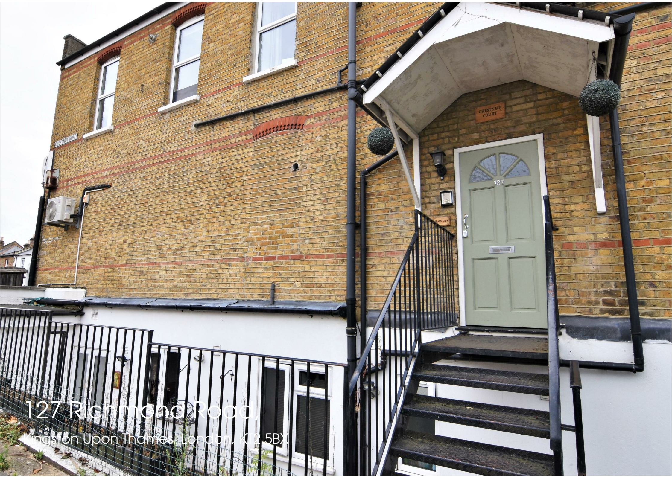
127 Richmond Road, Kingston Upon Thames, London, KT2 5BX